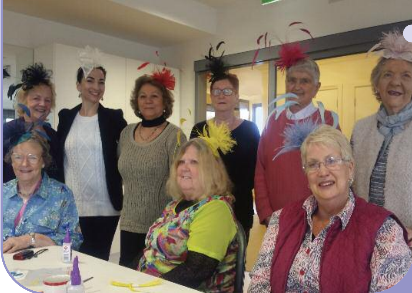
Amarco and Kingsville community residents and friends show off their hand made fascinators